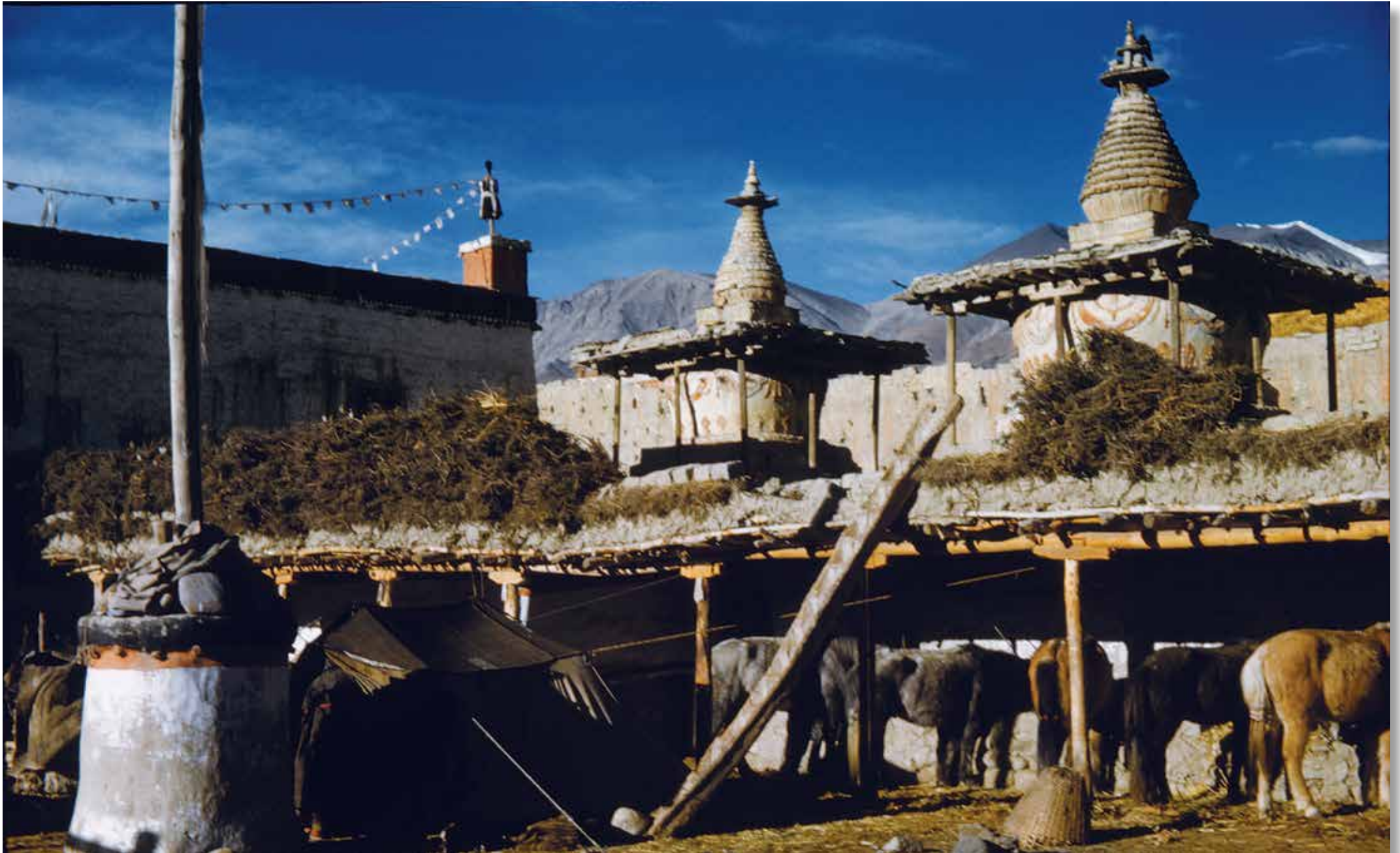
Horse stable inside the walled city of Lo Manthang.