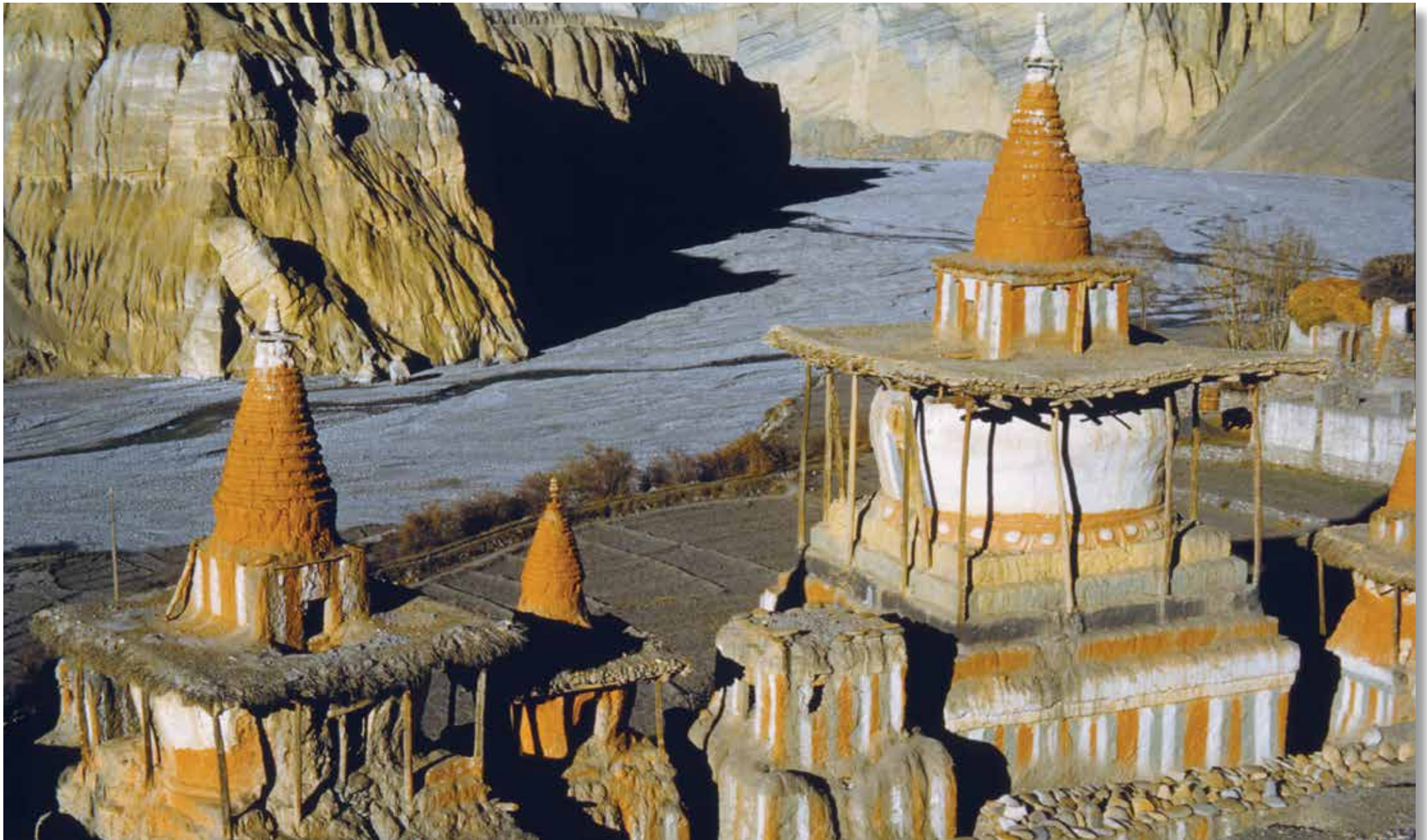
Chhortens at Tangbe, the first village along the trail to Upper Mustang.