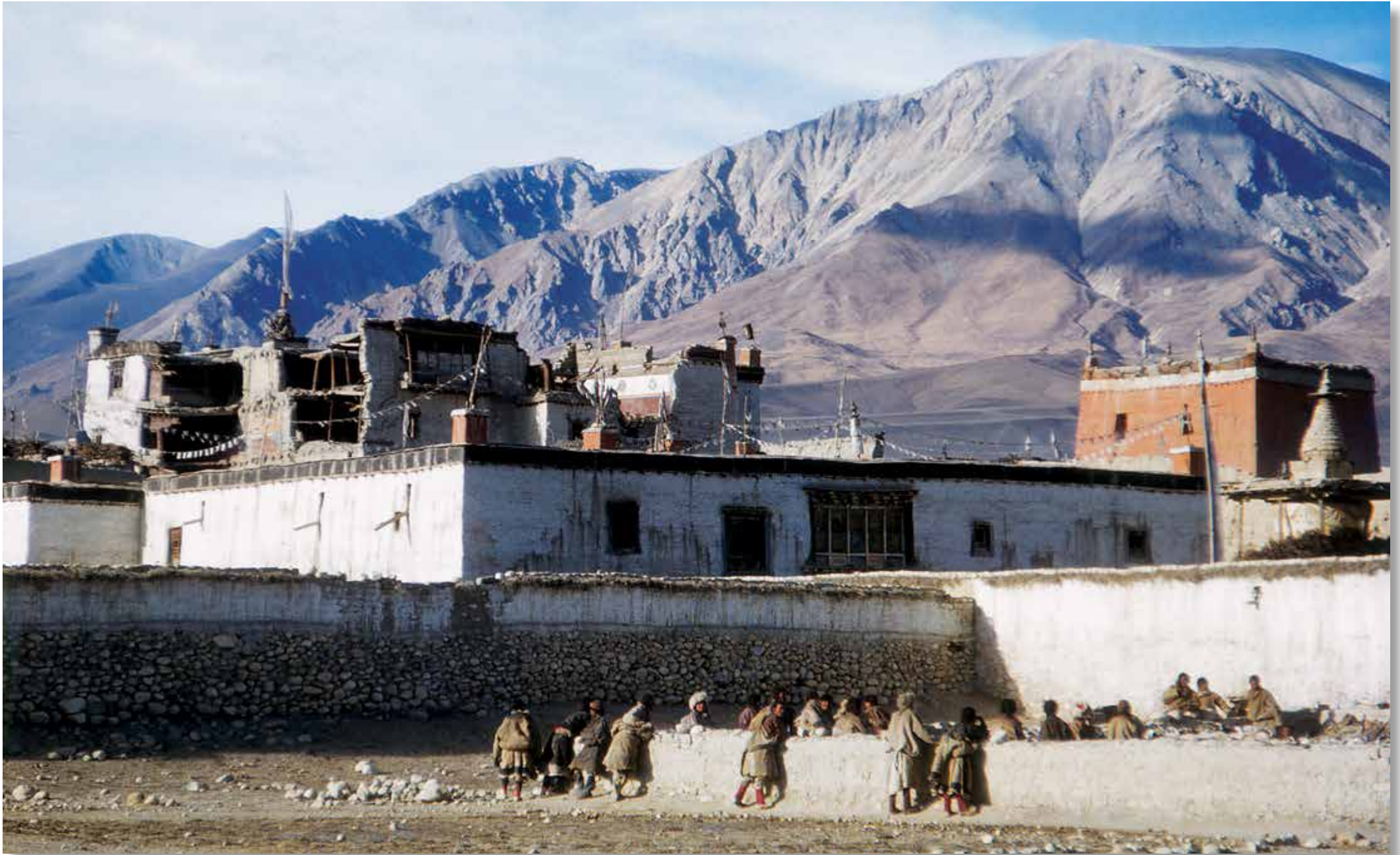
Lo Manthang, the capital of Mustang, is a walled city that still shuts its gates at nightfall.