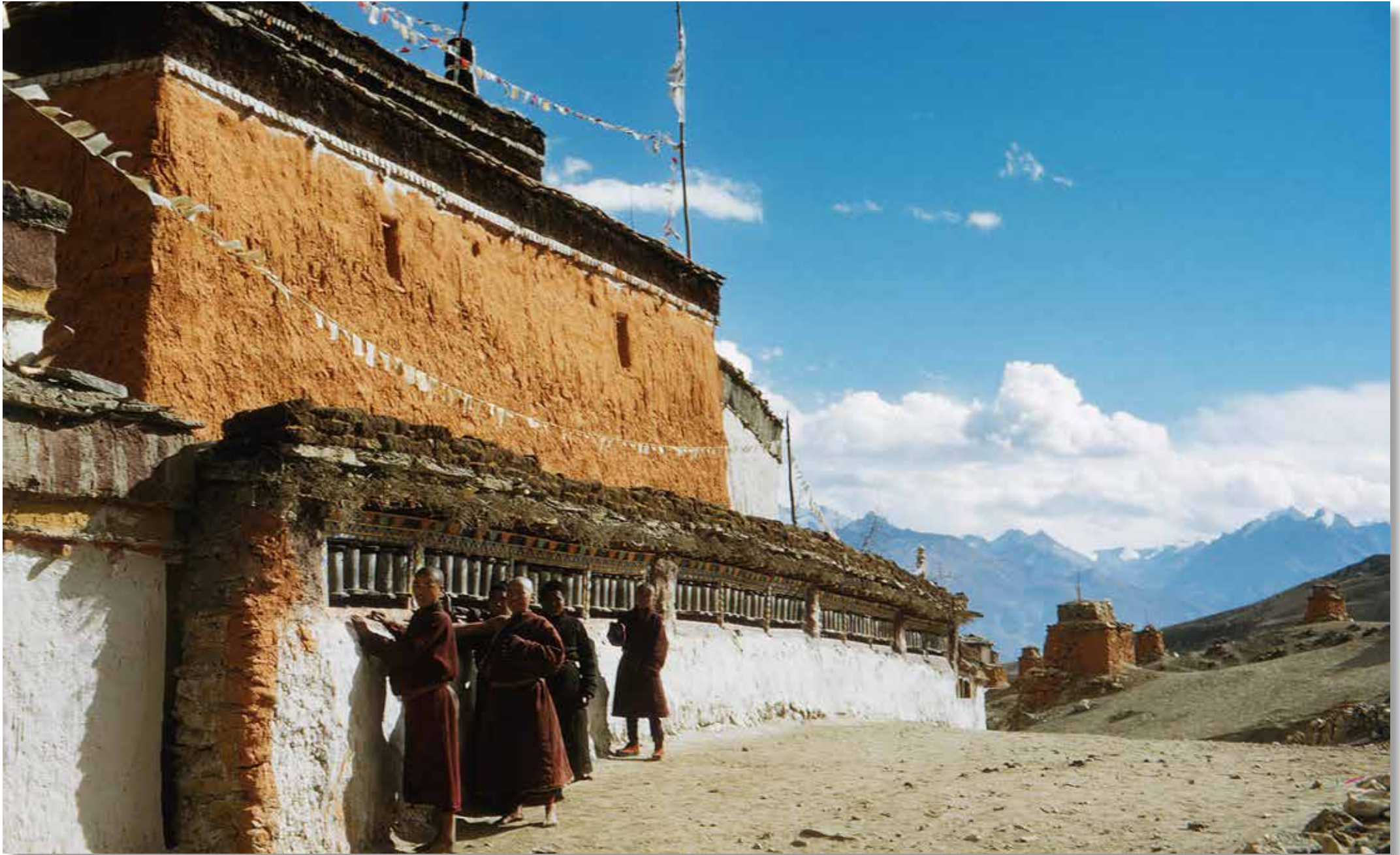
The main wall at Charang Monastery is still a much-visited site in Mustang.