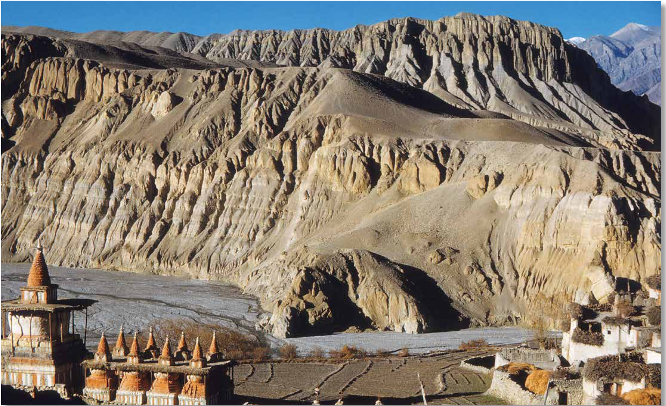
A section of the village of Gheling on the way to Lo Manthang.