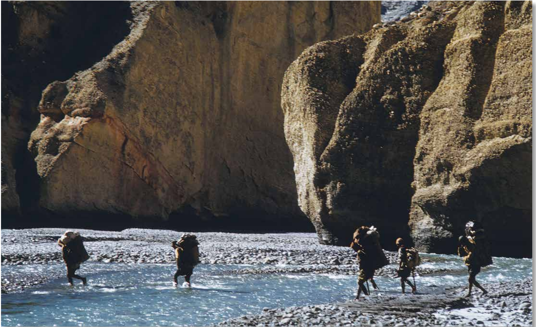
The River Kali Gandaki issues out of the narrow canyon just below the village of Chele.