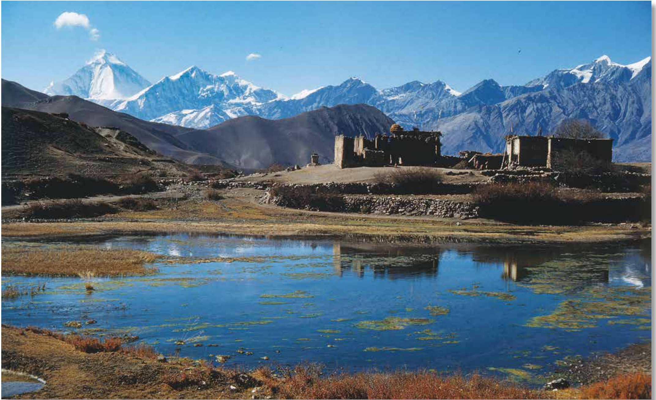
The pilgrimage site of Muktinath with the Dhaulagiri massif towering in the background.