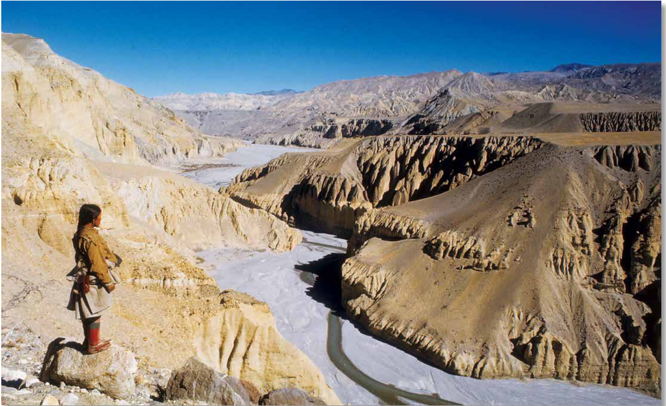
Looking north following the gorge created by the River Kali Gandaki.