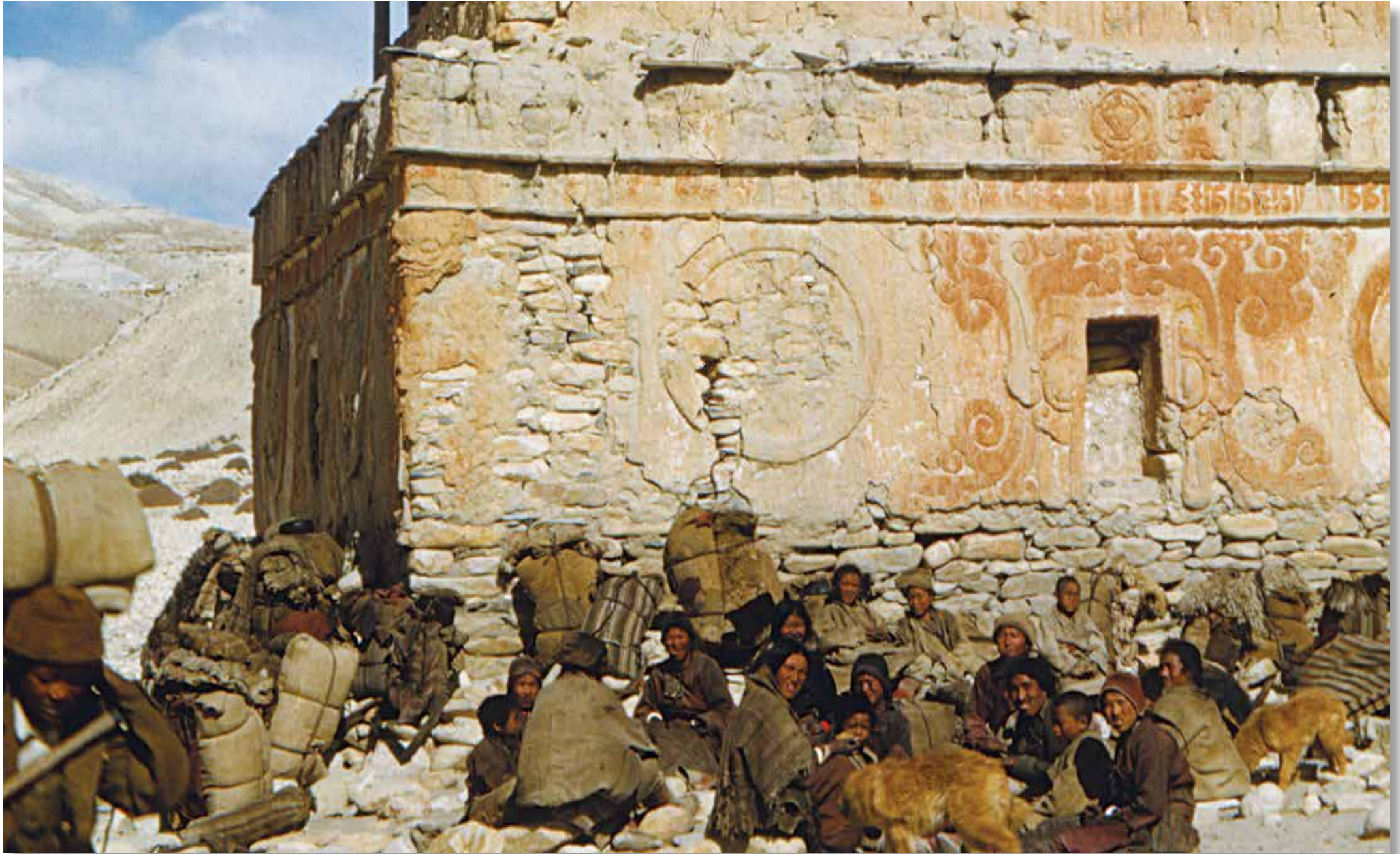
Tibetan traders carrying wool and salt resting by the great Sumit chhorten near the pass leading into Lo Manthang.