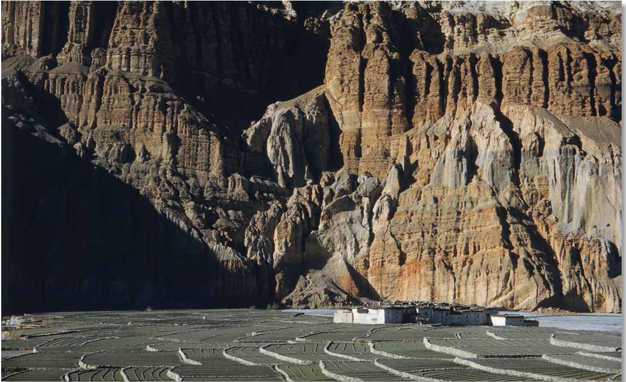
The village of Tsekyap by the side of the River Kali Gandaki.